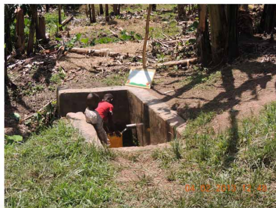
Figure 2 | Sample query results (English language version) for photo-assisted identification of household water source using Computer Assisted Survey Information Collection (CASIC) Builder™ software.

Water source number: 2 Cell: Nyamikanja 2 Village: Kyaritimbo Type: Spring Name: Kyaritimbo Select