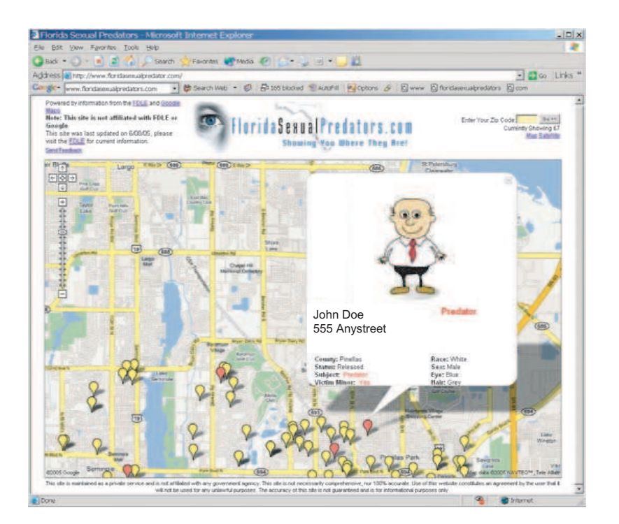
FIGURE 1-2 A Web-based GIS tool showing residences of sex offenders. The laws relating to public disclosure of the residence of sex offenders take on a different dimension when the addresses become part of a Web-based interactive mapping application (http://www.floridasexualpredator.com [accessed 24 May 2006]). This example listing has been made anonymous. Google Maps is a trademark of Google Inc. Used with permission.

Beyond Mapping: Meeting National Needs Through Enhanced Geographic Information Science http://www.nap.edu/catalog/11687.html