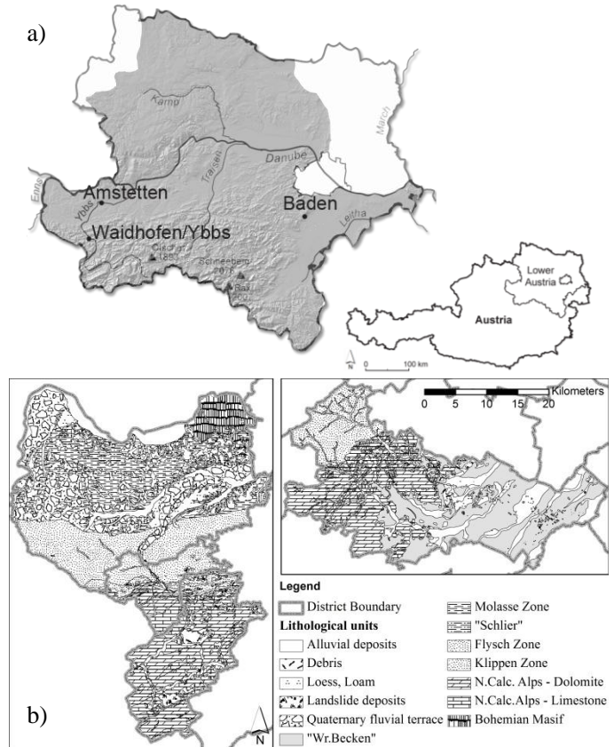
Figure 1. a) Location of Lower Austria and the capitals of the districts Amstetten, Baden and Waidhofen/Ybbs. The grey colour shows a hillshade map of the study area. b) Lithological map of the test districts. N.Calc.Alps = Northern Calcareous Alps.

The data on DTM, land cover and lithology, which comprises the data basis for the sampling of the explanatory variables, was set to the same spatial extent and resampled to a raster with 10m x 10m