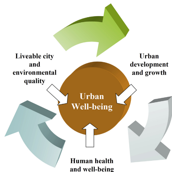
Fig. 3. Urban well-being and sustainable development.

should be a part of the overall development plan. This issue is of global interest, because many countries are in a process of rapid urbanization, and urban greening and urban forestry have an important role to play in the process of promoting quality of life and improving environmental quality (Skärback, 2007). In the case of shrinking cities, urban agriculture can be used as a policy to increase the quality of life for the remaining population (Panagopoulos et al., 2015).